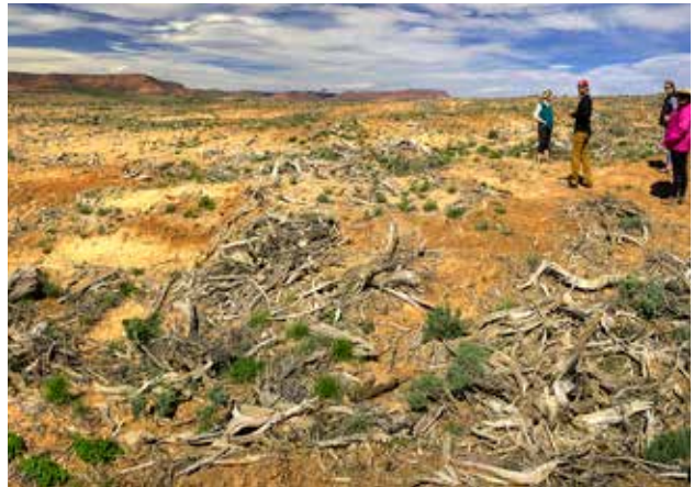
Clear-cut pinyon pine and juniper forestlands on the Plateau.

At the Grand Canyon Trust, we not only work on issues that affect the land and people of the Colorado Plateau, but also the animals that call these wild places home. In the rugged expanse of old-growth pinyon and juniper forests that sweep across Utah's Grand Staircase-Escalante National Monument, nearly one thousand species of wildlife abound. The monument is home to trees dating back 1,400 years that have adapted to the changing plateau for over a millennium, and the animal life that relies on these forests has adapted right along with them.