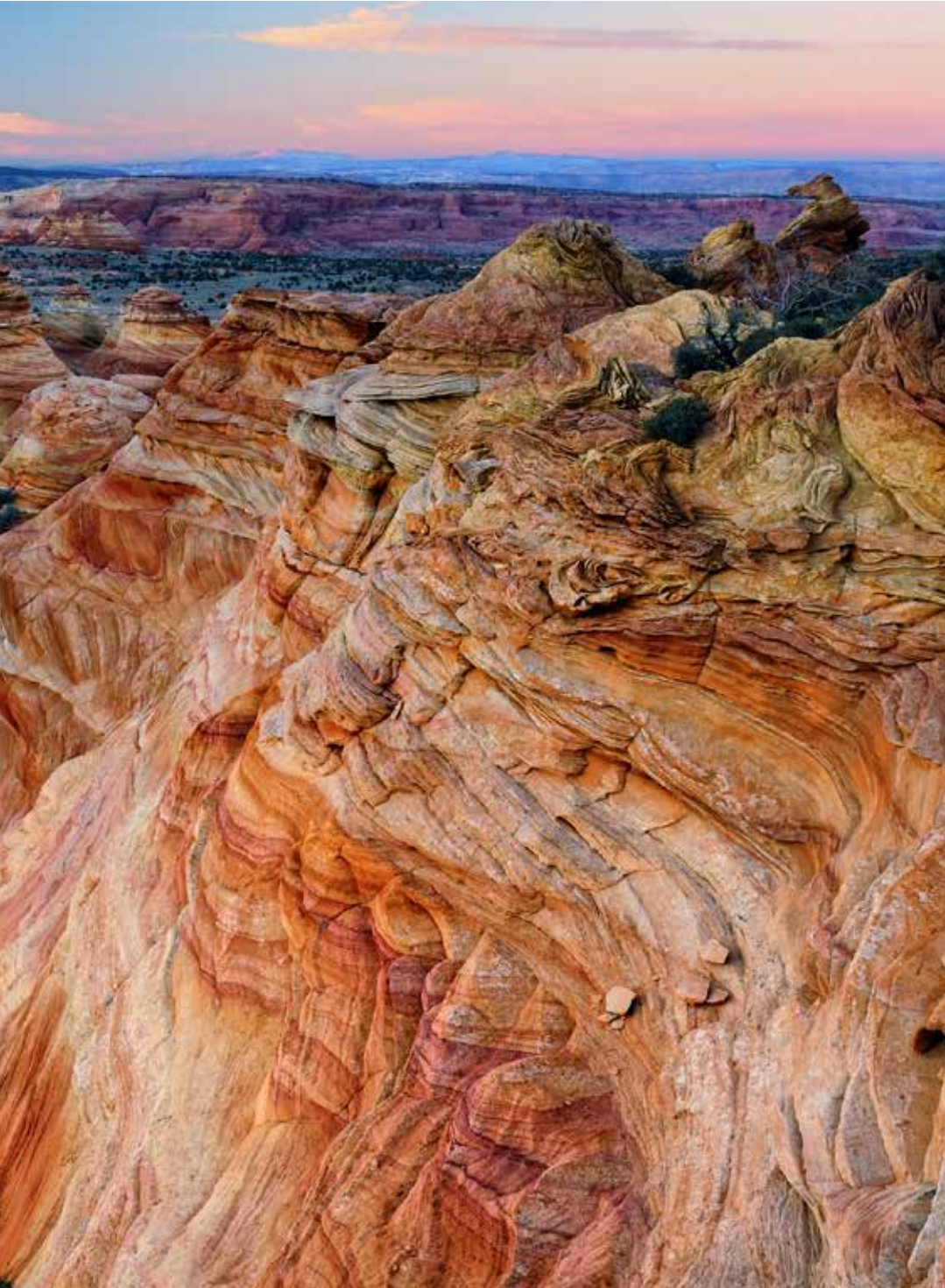
South Coyote Buttes. RICK GOLDWASSER

Colorado Plateau, while supporting the rights of its Native peoples.