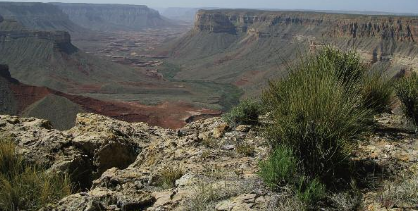
Kanab Creek looking south to Grand Canyon, is lined with uranium claims.

“OUR WELL OF KNOWLEDGE IS BONE DRY,” QUIPPED MY HYDROLOGIST FRIEND. I WAS DEMANDING TO KNOW WHY ONE OF MY FAVORITE SPRINGS IN THE GRAND CANYON WAS DISAPPEARING AFTER SERVING MY BACKPACKING NEEDS FOR MORE THAN TWO DECADES. I WANTED TO KNOW WHAT WAS CAUSING IT TO GO DRY AND ALL THE FERNS AROUND IT TO DIE.