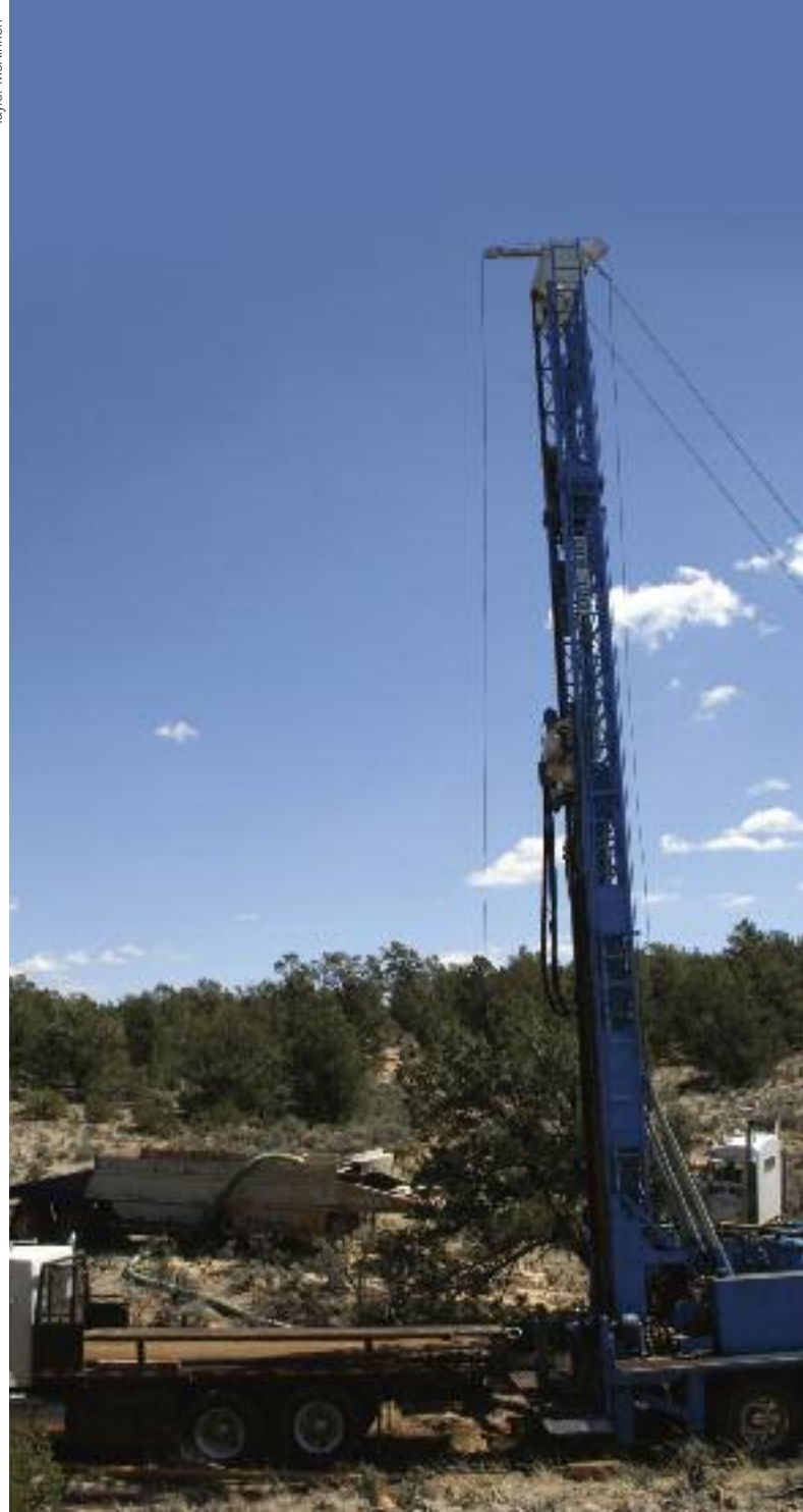
Above: Vane Minerals drilling rig just east of Grand Canyon National Park entrance.

The measures face a tougher test in the U.S. Senate, where important environmental and taxpayer protections could easily be watered down by some western lawmakers who seem reluctant to embrace full-scale reform.